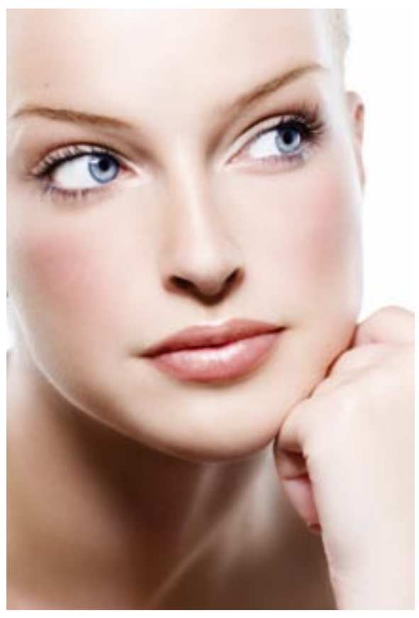
COFFEE SCRUB 60 minutes $85 Coffee increases lymphatic drainage and rids the body of toxins and leaves skin firm and soft.