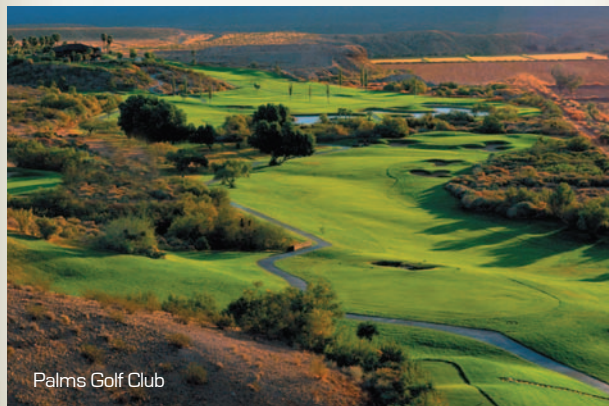
Palms Golf Club